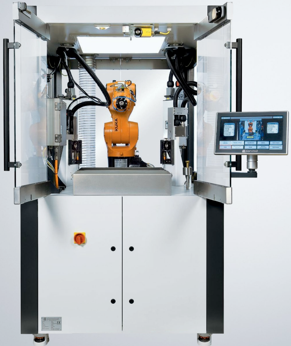
The turnkey, fully automatic PTU1200 plasma cell executes the complete plasma process and can be connected to any commercial injection molding machine.

With the chemical-physical Plasma-SealTight process, functional nano-layers can be selectively applied within milliseconds to generate tight bonds between different materials.