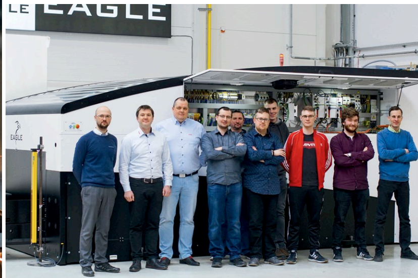
The project team in front of an Eagle Inspire laser cutter equipped with a 15 kW laser and an integrated loading and unloading system.

based control system allow us to expand each machine's functionalities with great flexibility, for example by integrating the CNC interpolation. We can also integrate our own solutions, such as the visualization system, which is based on our own proprietary solution," explains Marcin Masternak.